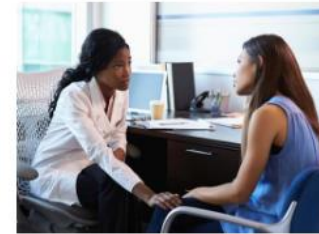
Enhancing Behavioral Health Access