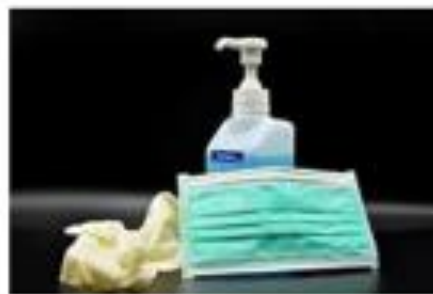
PERSONAL PROTECTION EQUIPMENT