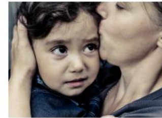
Strengthening Health and Human Services Safety Net