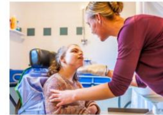
Supporting Sound Medicaid Policy