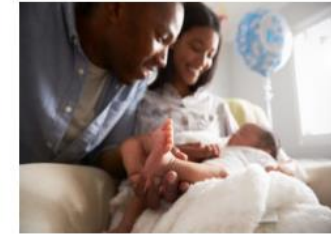
Improving Maternal and Infant Health