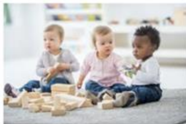
LOWER RATIOS SMALLER GROUP SIZES

Child Care Programs – COVID19 Challenges