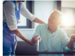
Advancing Wellbeing of Older Adults