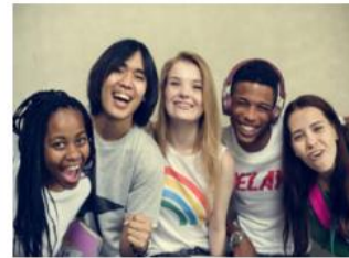
Promoting Comprehensive Reproductive Health Education